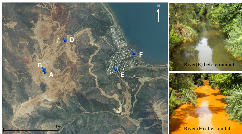
Fig. 1 The mining centre, the village of Poro and location of the five sampling sites at the top of the mining catchment (A, B), at the bottom of the mine (D), in the river (E) and at its mouth (F). Pictures of the river before and after a rainfall show particulate matter run-off

Cr (Cr(III) + Cr(VI)) was measured by atomic absorption spectrometry according to the AFNOR French procedure (NF EN 1233, AFNOR 1996). All reagents were of analytical grade.